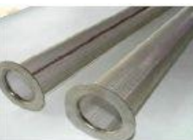
Cone-shape Filter Screen

Welcome to visit website www.zoyals.com for more informations. We can make them according to customers' requirements or drawings.