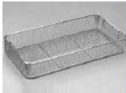
Wire Mesh Basket