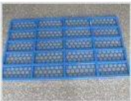
Oil Vibrating Screen