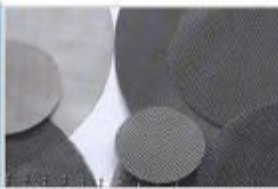
Black Wire Cloth