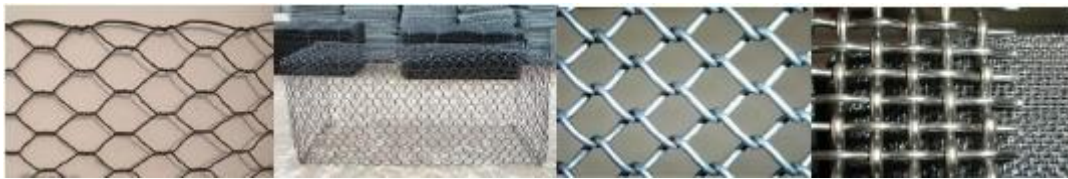
Hexagonal Wire Mesh