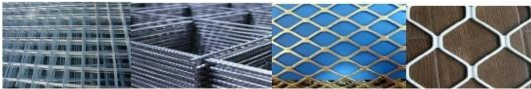
Welded Wire Mesh