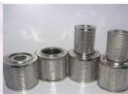
Stainless Steel Filter